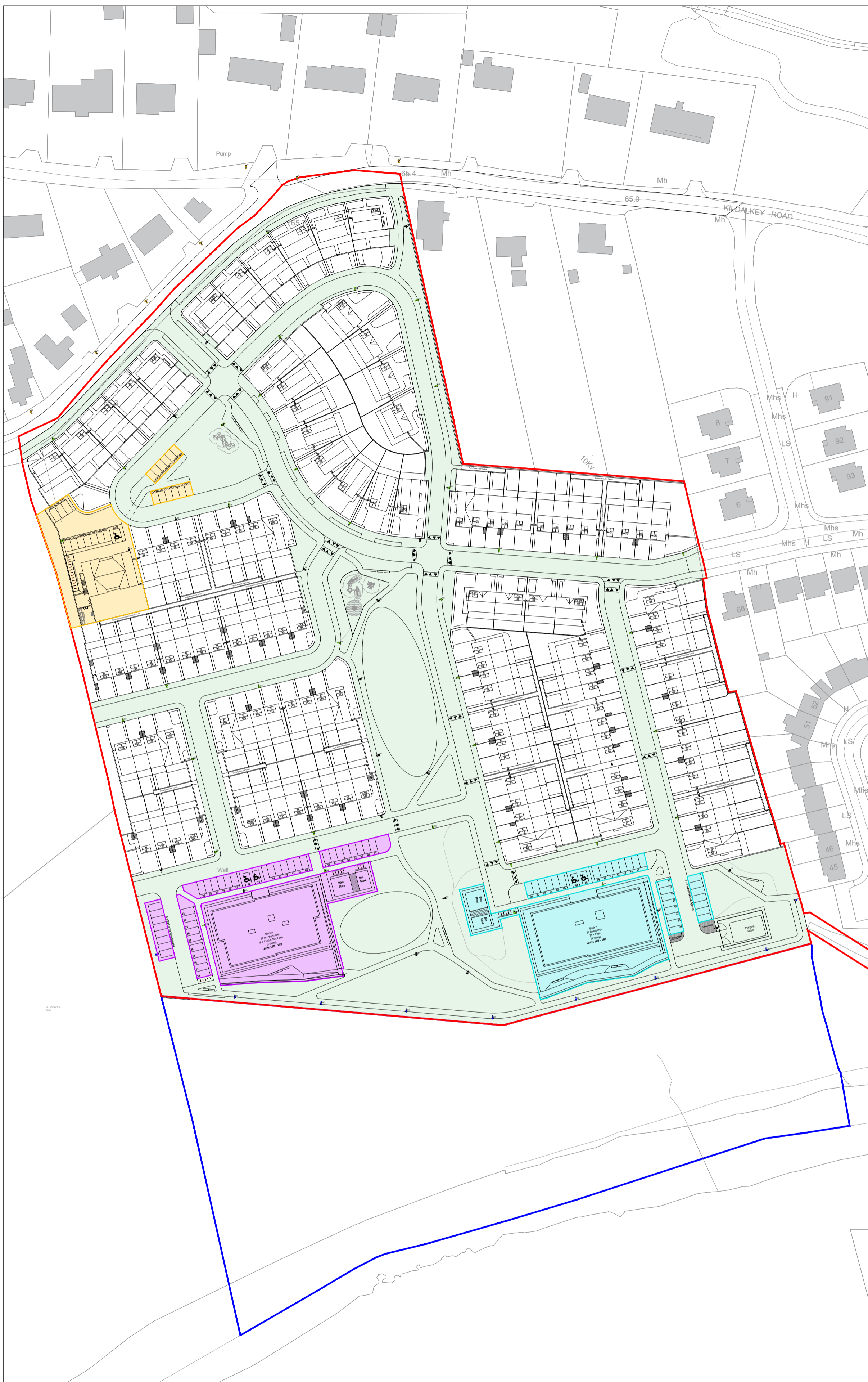
PROPOSED SITE LAYOUT PLAN (TAKING IN CHARGE & MANAGEMENT COMPANY AREAS) SCALE 1:1,000

O.S. Ref: 2710-D GROSS AREA OF SITE EDGED RED = 6.087 HA NET DEVELOPMENT AREA (NDA) OF SITE = 5.648 HA 183 RESIDENTIAL UNITS PROPOSED (127 HOUSES + 56 APARTMENTS) PROPOSED DENSITY = 32.40 DPH PROPOSED PUBLIC OPEN SPACE PROVISION (8,842m 2 ) = 15.65% NDA